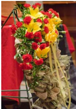
VETERANS DAY "WELCOME HOME" CEREMONY